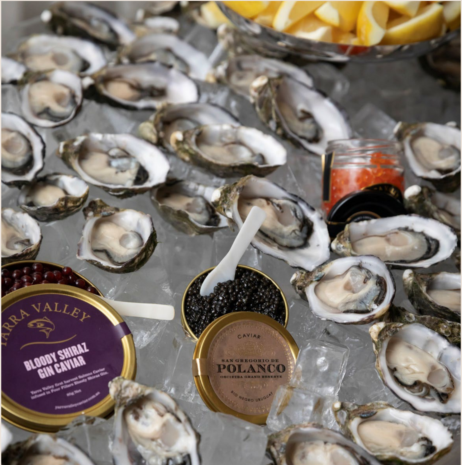
Menu subject to change. Dietary options available.