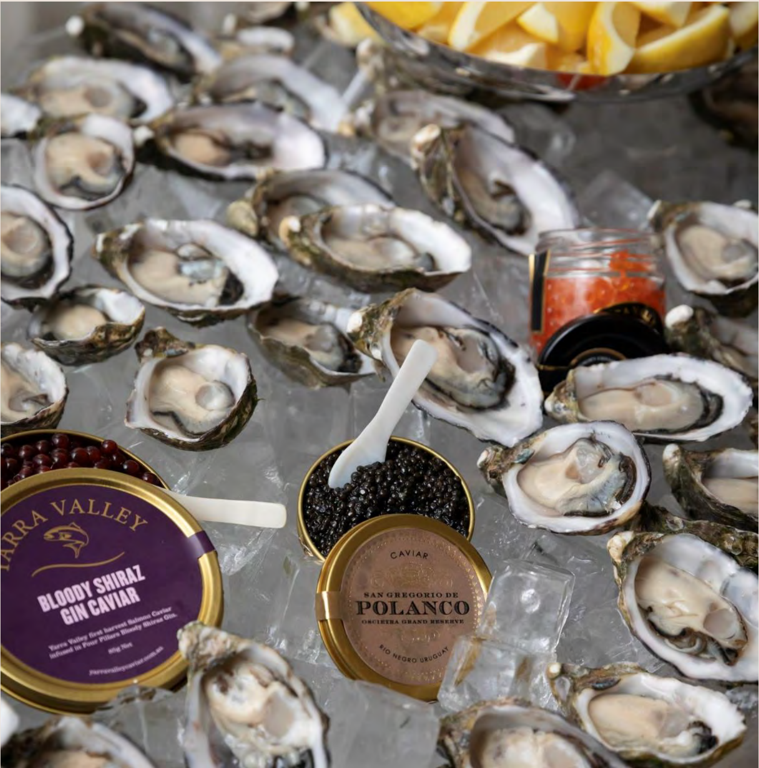
Menu subject to change. Dietary options available.