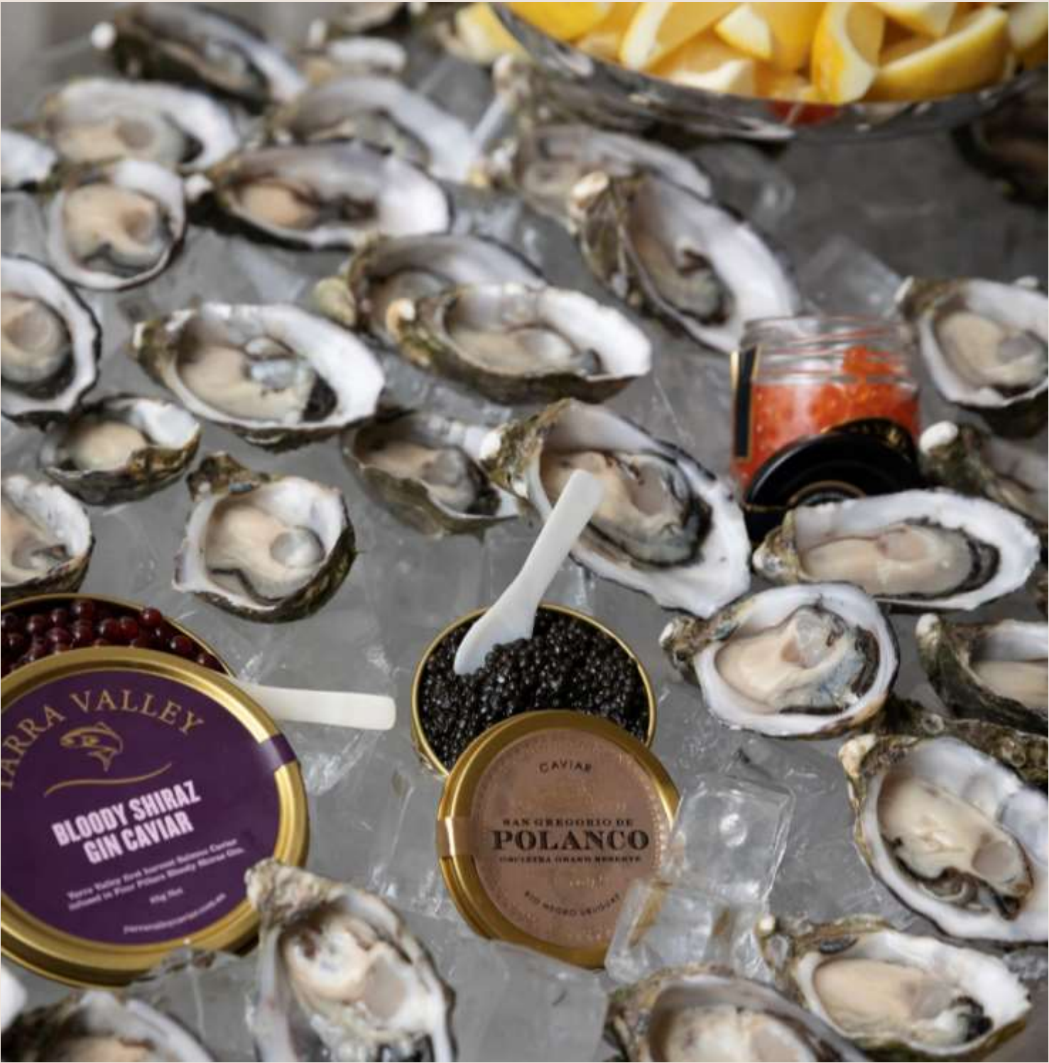
Menu subject to change, sample menu shown. Dietary options available.