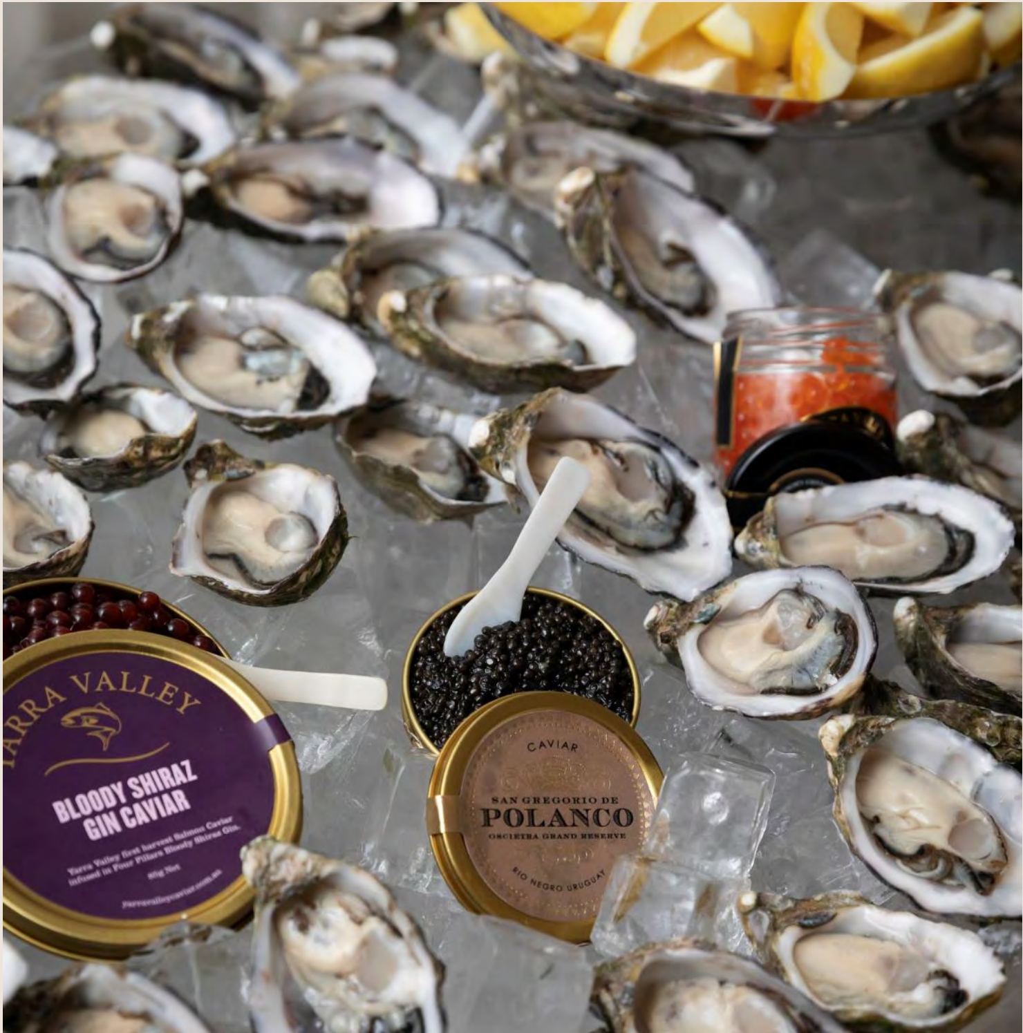
Menu subject to change. Dietary options available.